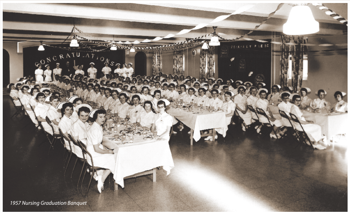
1957 Nursing Graduation Banquet

2011 marks the 100th anniversary of the first graduating class of St. Paul's Hospital School of Nursing.